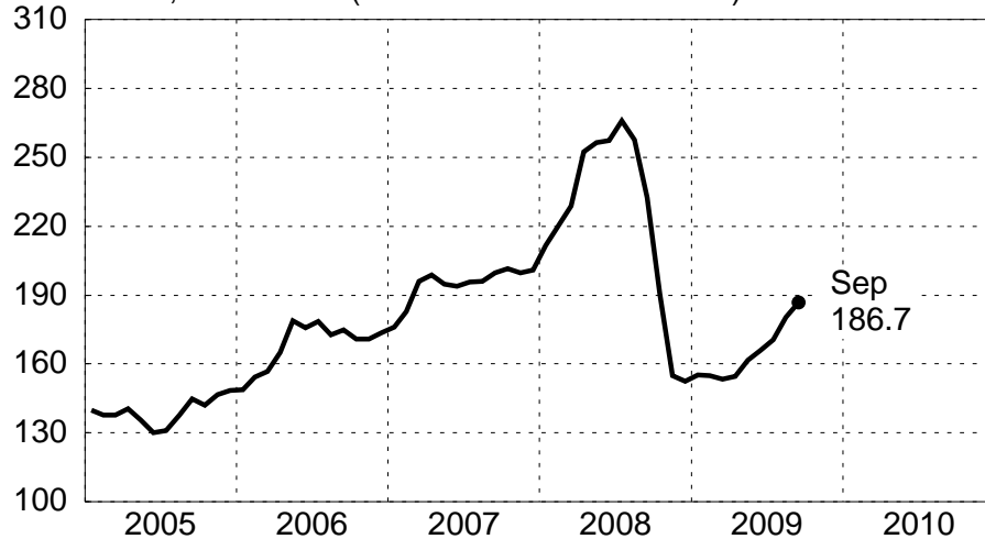
U.S. Producer Prices for Raw Materials Index, 2000=100 (Bureau of Labor Statistics)