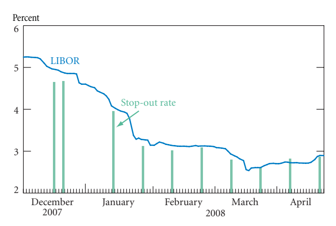
Chart 2 LIBOR and the Term Auction Facility Stop-Out Rate

Notes: All rates are for a term of one month. LIBOR is the London Inter-Bank Offered Rate.