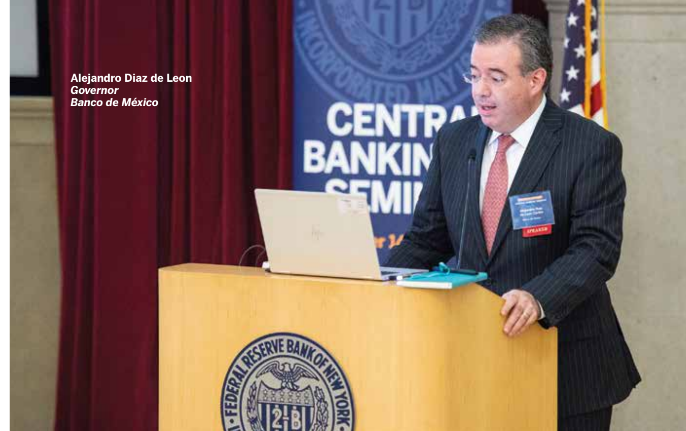
Alejandro Diaz de Leon Governor Banco de México