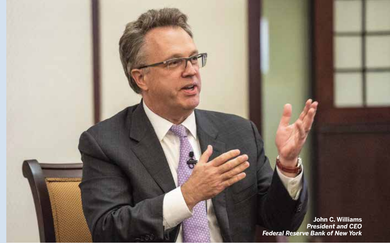
John C. Williams President and CEO Federal Reserve Bank of New York