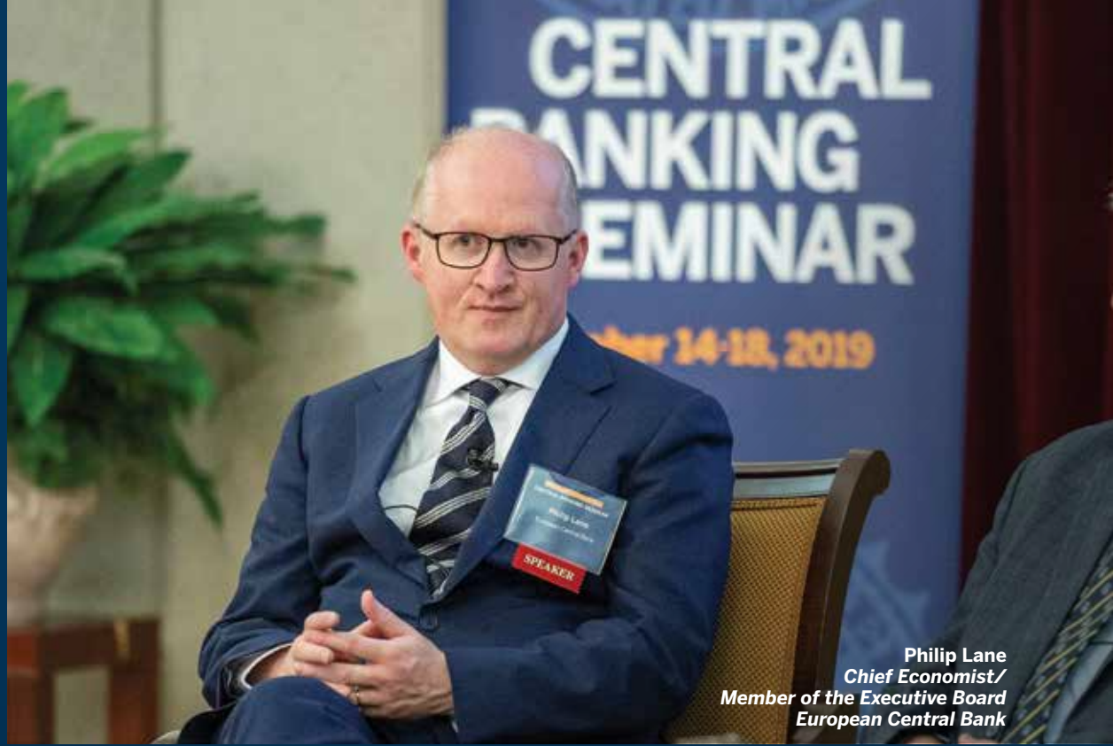
Philip Lane Chief Economist/ Member of the Executive Board European Central Bank