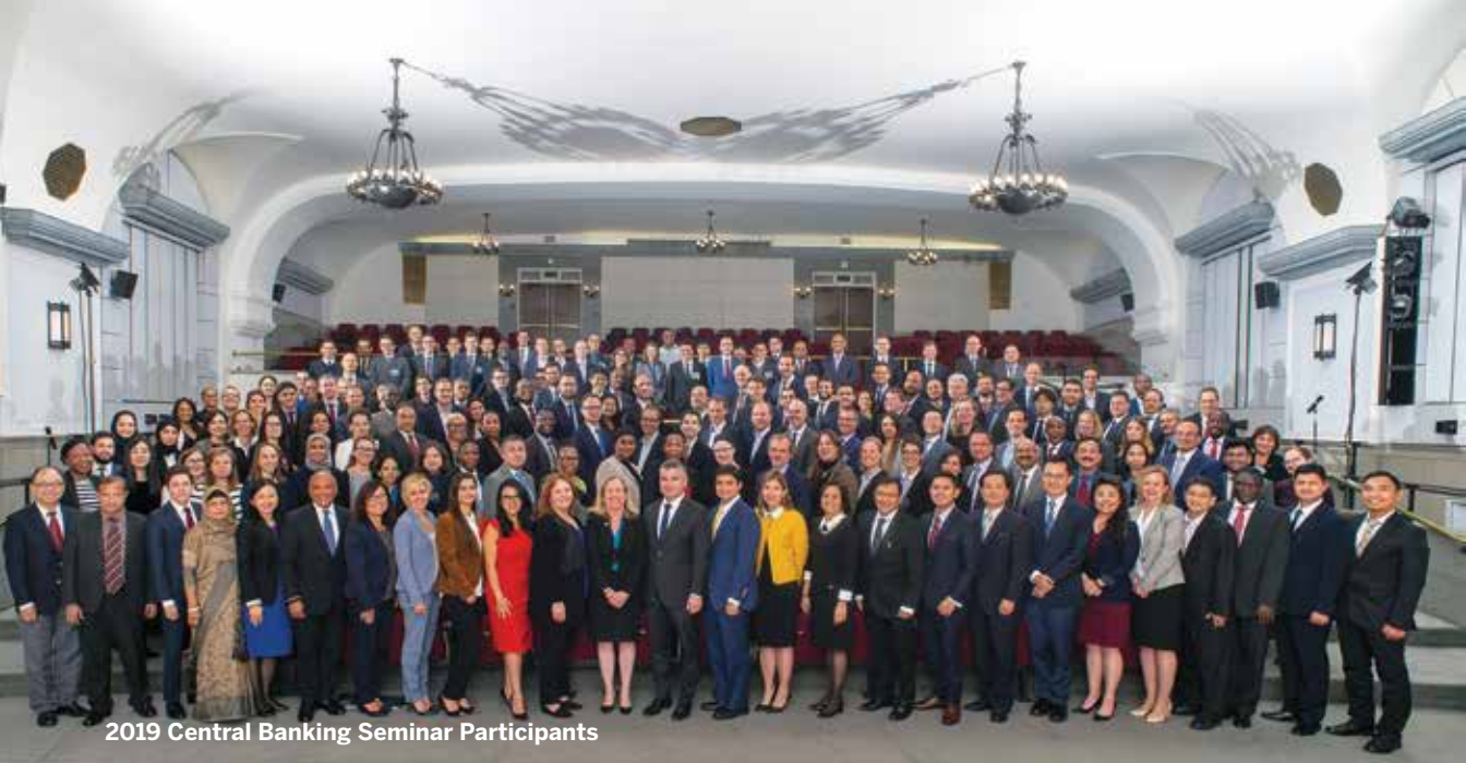
2019 Central Banking Seminar Participants